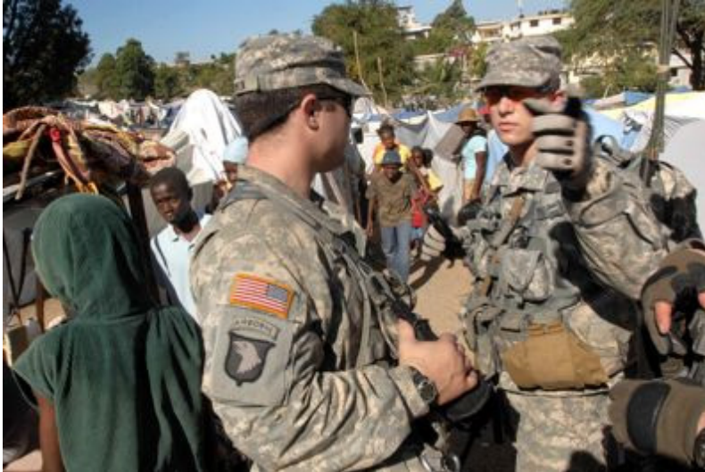
U.S. Parachutists in Haiti.

In publishing "Was the earthquake in Haiti caused by the United States", our purpose was to bring out an issue that is stirring military and media circles in several countries, but which is being ignored in others [1]. What matters here is not to take a stand. In keeping with our approach, though often misunderstood, we maintain that it is impossible to have a good grasp of international relations without studying what the leaders of this planet are thinking.