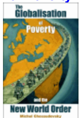
by Michel Chossudovsky also available in pdf format

1) All the global banks were up to their eye-balls in toxic assets. All the AAA mortgage-backed securities etc. were in fact JUNK. But in the balance sheets of the banks and their special purpose vehicles (SPVs), they were stated to be worth US$ TRILLIONS.