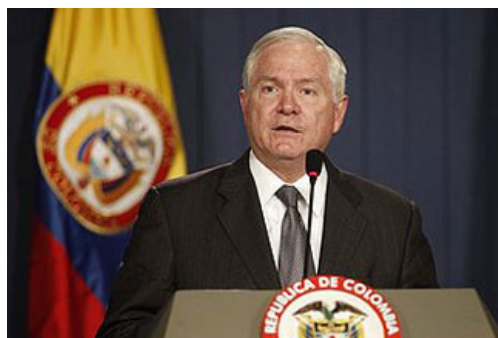
US Defense Secretary Robert Gates

A secret memo by US Defense Secretary Robert Gates urges Washington to consider the use of military force against Iran if diplomacy fails to scrap the country's nuclear program.