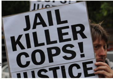
The Rodney King case compounded anger at police who were perceived as racist