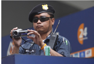
Security forces around the world use video evidence