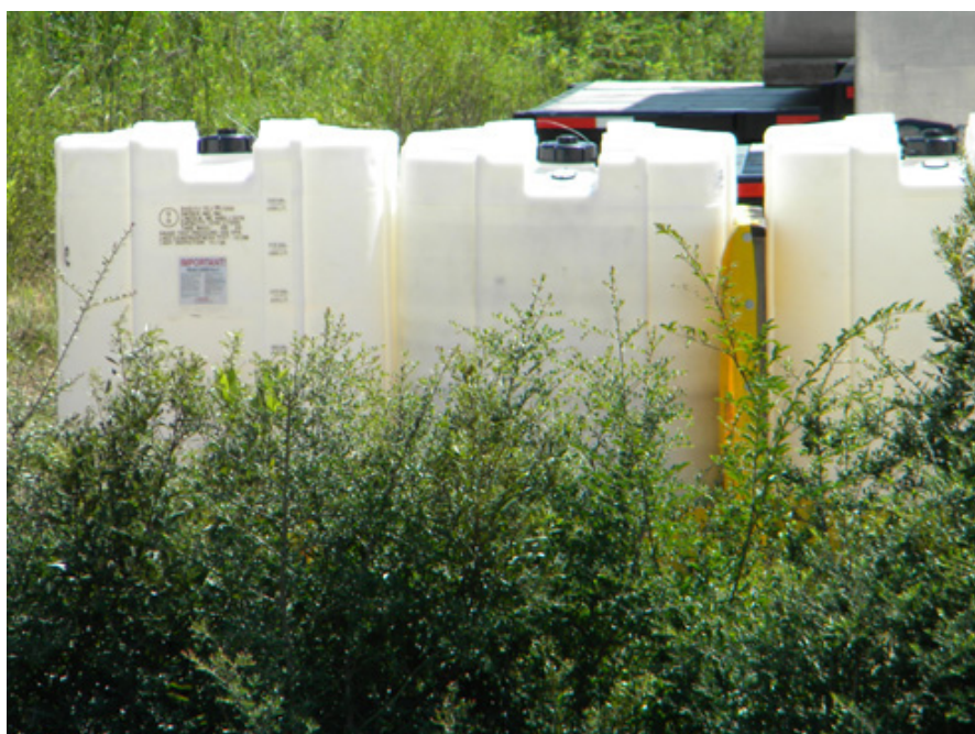
Corexit tanks, September 1, 2010.

Her August 16 entry details her discovery: