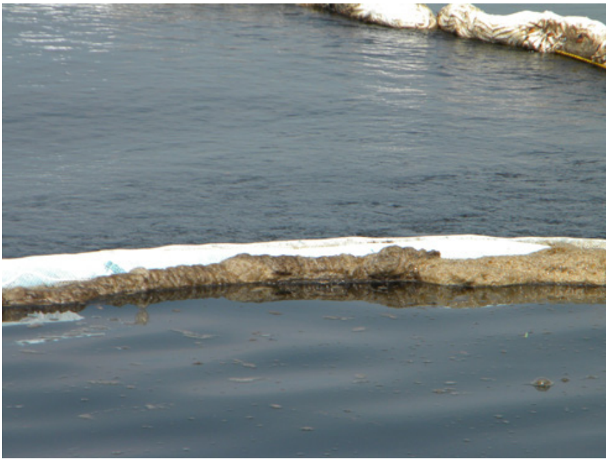
Oiled boom, August 5, 2010.