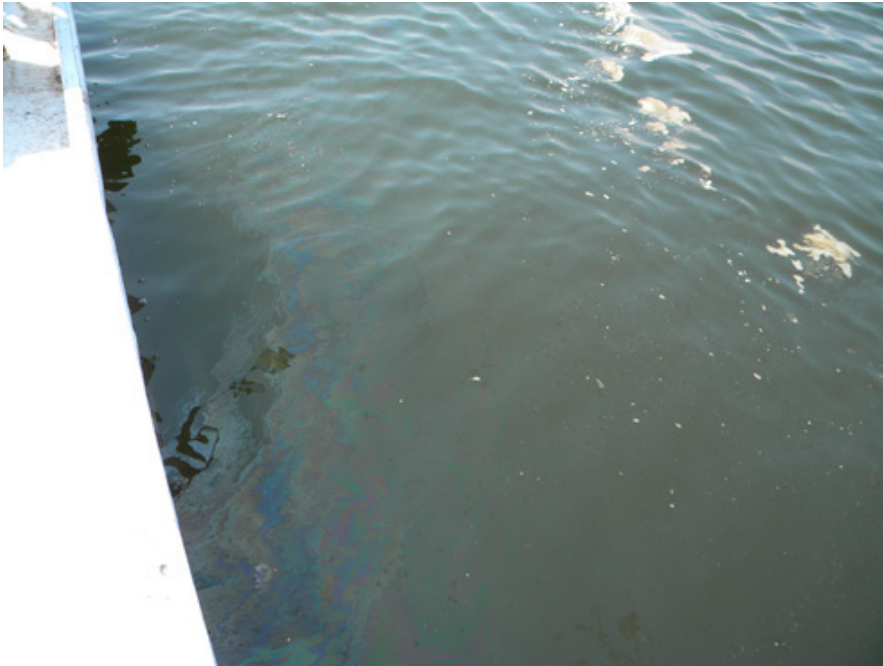
Oil sheen and dispersant remnant, August 1, 2010.