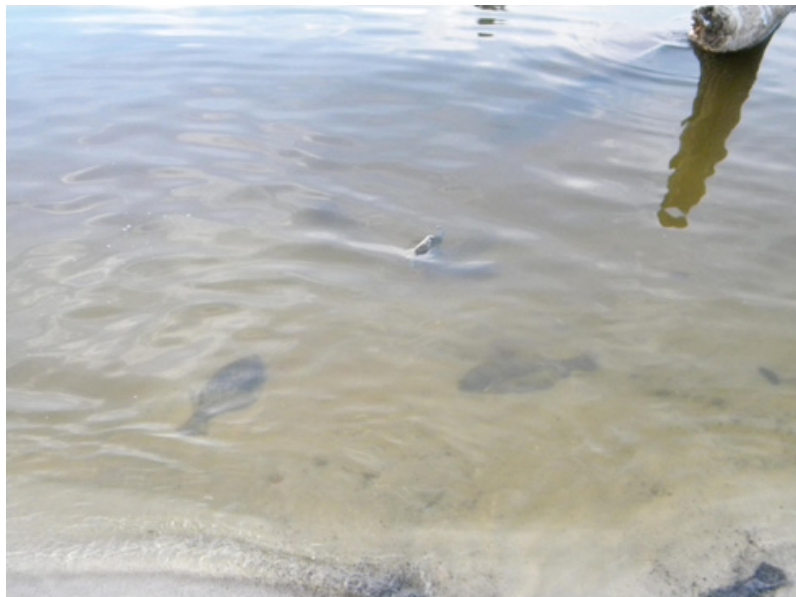
Dead flounder among fish kill, August 6, 2010.