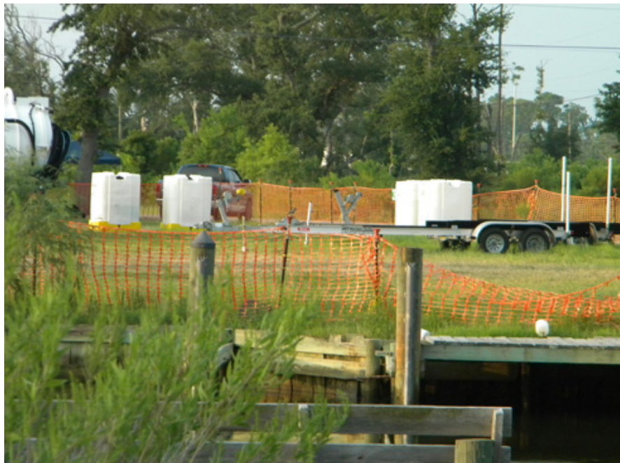
Corexit tanks, September 1, 2010.