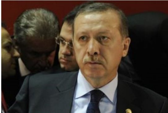
Turkish Prime Minister Recep Tayyip Erdogan

Turkish Prime Minister Recep Tayyip Erdogan says the dispute over Iran's nuclear program has been resolved and the international community should focus on Israel now.