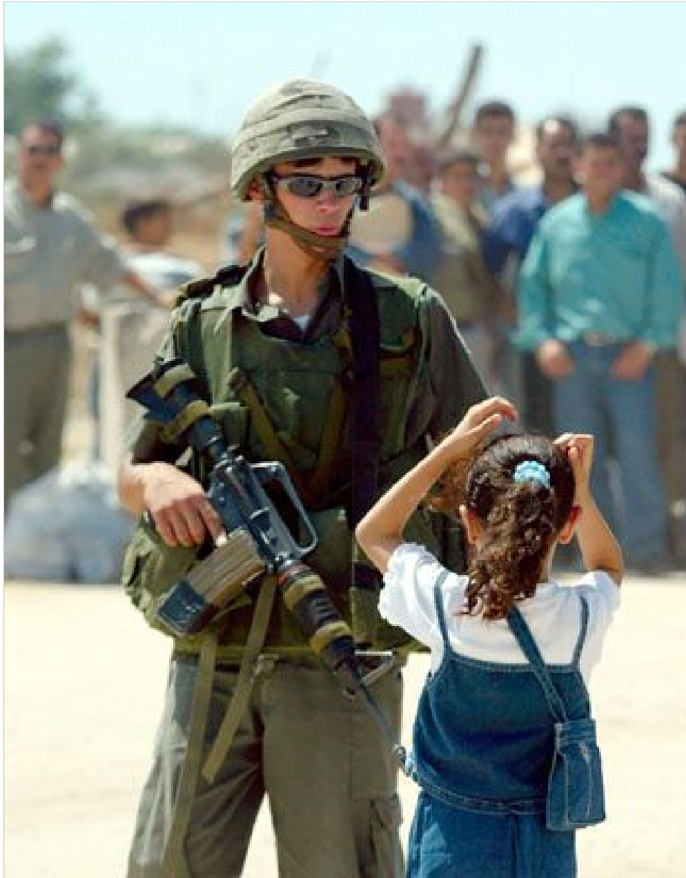
Israeli Soldier Terrorizing Little Girl | Intrinsic Evilness

In the first article of this series ( Defeating Israel ) I commented on a possible result of Israel being recently defined as a terrorist organization by the Human Rights Commission of the UN. An international army could be