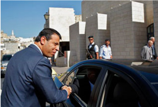
Mohammed Dahlan, the member of the Fatah Central Committee, is accused of spying for Israel.

Hamas has accused senior Fatah official, Mohammed Dahlan, of spying for Israel and gathering information on Hamas member's whereabouts, Fars news agency reports.