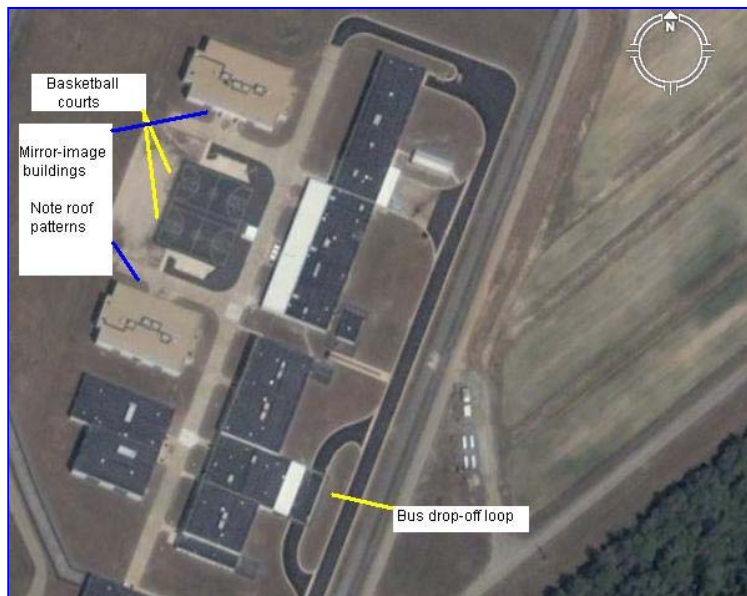
Fig. 6 – Training facility closer view. Complex shown is approximately 1/4 mile long. Note that roof patterns are exact mirror images of one another. Note complete absence of vehicles around these buildings, even though a driveway runs through the complex.