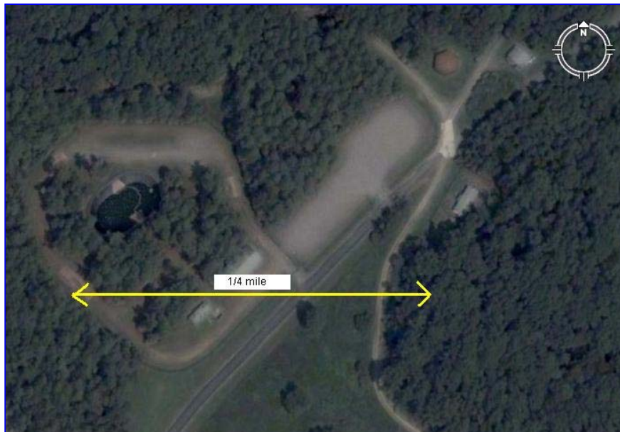
Fig. 3 – Un-retouched photo showing POW camp complex and approximate overall size. Uncle has airbrushed these satellite images. No small wonder - seeing a POW camp with the concertina wire topped fence IS unsettling.