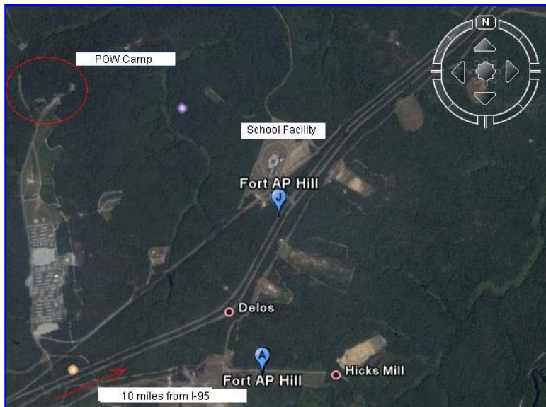
Fig. 1 – POW camp and school or training facility at Ft. AP Hill army base, Virginia. Note the road system that interconnects all the facilities in this photo. The red arrow (bottom left) is a divided highway that runs to an exit ramp of interstate 95. There is a sign for Ft. AP Hill on I-95 north and south.

We will start with overview images of the POW camp and training facilities, and look at these in more detail later. Ft. AP Hill base is approximately 10.7 miles east to west and 14.8 miles north to south, for a total size of about 158 square miles.