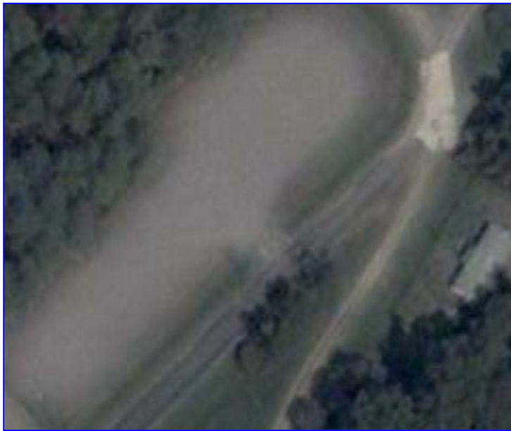
Fig. 4 – Unmistakable censoring of the POW camp location. Turnoff for the camp is visible near center of image with the insulated cluster of trees. Although Ft. AP Hill covers 158 square miles, this area appears to be the only part censored in Google maps