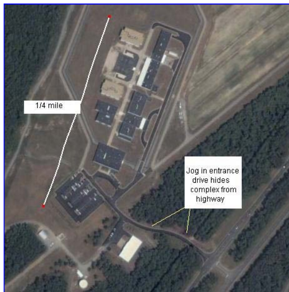
Fig. 7 – Actual size of training facility from a higher altitude showing how the facility entrance is hidden from the highway.