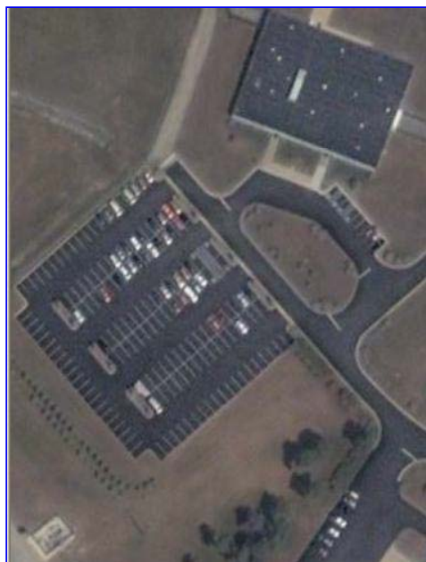
Fig. 8 – A total of 64 vehicles are visible parked in this photo in all three parking lots. Center parking lot has a capacity of approximately 216 vehicles. This is an enlargement of the parking lots previously seen in Fig. 7. Three RVs or trailers are visible in the center parking lot, occupying three end-to-end parking spaces at the left