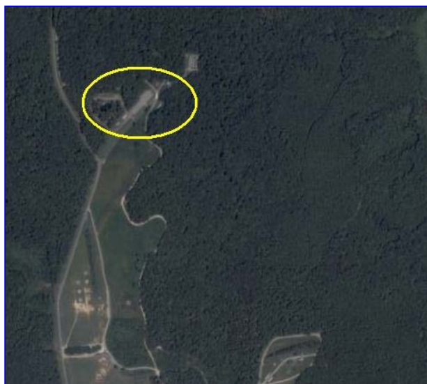
Fig. 2 – POW camp from 6600 ft. shows it is located in an isolated area deep in the base (where no one will hear the screams.) The nearest town is several miles away.