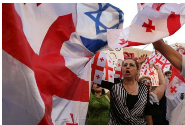
Israelis wave both Georgian and Israeli flags as they chant anti-Russian slogans during a demonstration outside the Russian embassy in Tel Aviv, 11 August.