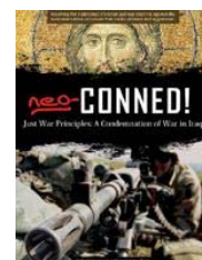
"Neoconned" and "Neoconned Again", two new collections of essays