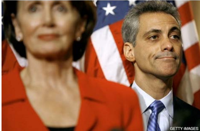
Rahm Emanuel, an Israeli soldier and the son of a real Zionist terrorist, will be the next White House chief of staff.

other nation would automatically lose his U.S. citizenship for serving in a foreign military. Why do we let Israelis run our government? What will it take to remove people like Emanuel and Michael Chertoff to prevent them from damaging our American republic even more? The Zionist agents in our government are clearly in the process of accumulating power and not at all afraid of showing it. This is a very dangerous development.