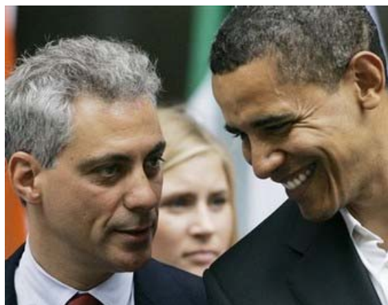
Emanuel has controlled Obama for years.

Thank you. Your support is needed to continue my work.