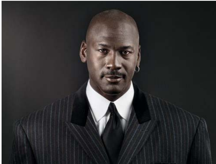
Michael Jordan would be an ideal U.S. Secretary of State.

Jordan is impressive, has a strong strategic mind, and knows how to win against incredible odds. We've seen him do it many times. He is articulate, greatly admired around the globe - - and he can fly. Under Barack Obama and old foreign policy hand Sen. Joe Biden, who could possibly be a better representative for the new administration than Michael Jordan? (Of course, Jordan would probably refuse to work with a nasty fellow like Emanuel, but he could stuff the Israeli.)