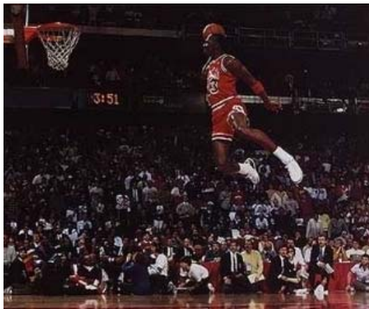
Michael Jordan with the Chicago Bulls

Jordan is impressive, has a strong strategic mind, and knows how to win against incredible odds. We've seen him do it many times. He is articulate, greatly admired around the globe - - and he can fly. Under Barack Obama and old foreign policy hand Sen. Joe Biden, who could possibly be a better representative for the new administration than Michael Jordan? (Of course, Jordan would probably refuse to work with a nasty fellow like Emanuel, but he could stuff the Israeli.)