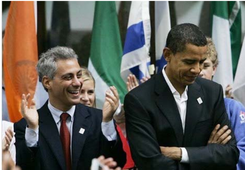
The Israeli Emanuel will manage the Obama White House.