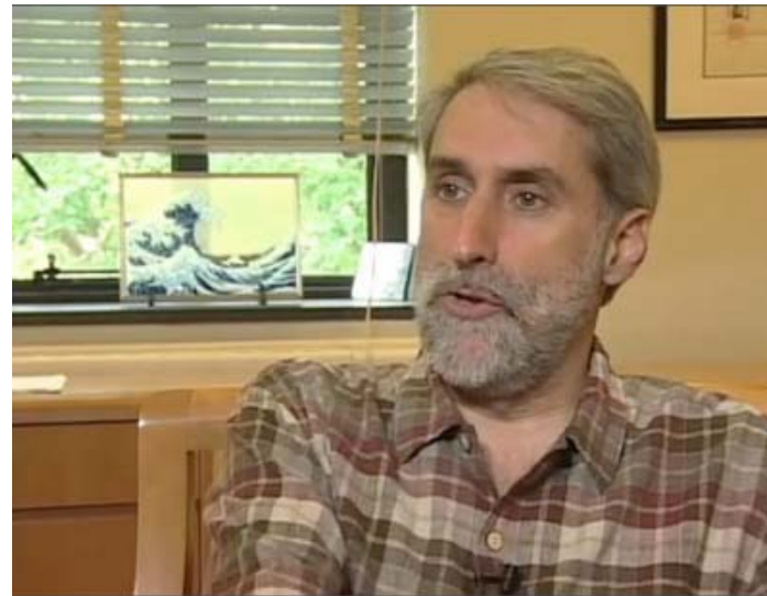
Daniel Nocera describes new process for storing solar energy View video post on MIT TechTV

In a revolutionary leap that could transform solar power from a marginal, boutique alternative into a mainstream energy source, MIT researchers have overcome a major barrier to large-scale solar power: storing energy for use when the sun doesn't shine.