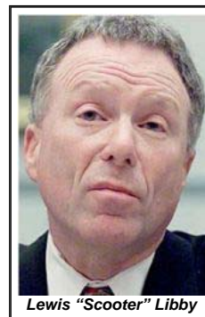
Lewis “Scooter” Libby

Three influential pro-Israel think tanks promoted these same ideas: The Jewish Institute for National Security Affairs (JINSA), The Middle East Media Research Institute (MEMRI), and the Center for Security Policy (CSP). Many of “the Vulcans” were, or continue to be, board members of these organizations that advocate total war in the Middle East — all in the name of Israel’s security. And lost in all this war talk was any concern for a just and lasting peace with the Palestinians.