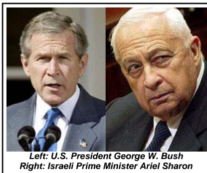
Left: U.S. President George W. Bush Right: Israeli Prime Minister Ariel Sharon

Today, some of these high-ranking individuals in the Bush administration are collectively known as “Israeli Firsters,” implying that they put the interests of Israel over those of the United States.