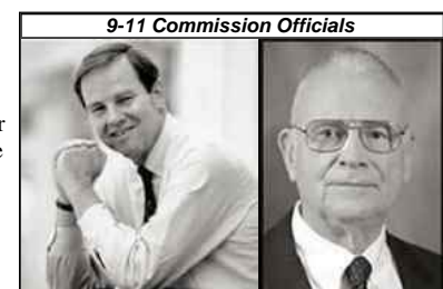
9-11 Commission Officials

The tragic irony is that the war and occupation has turned Iraq into a prolific recruiting ground and on-the-job training facility for al Qaeda, with American soldiers and civilian contractors now serving as targets for car bombs, sniper fire, roadside bombs, and rockets.