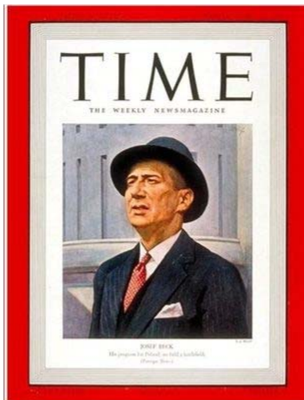
TIME MAGAZINE, 06 March 1939.

Josef Beck, Polish politician, born Warsaw Oct. 4, 1894, died Stanesti, Roumania, June 5, 1944. As a member of the inner circle, he worked with Pilsudski after the coup, and was Foreign Minister from 1932-35. As Foreign Minister under Zaleski (who succeeded Pilsudski), Beck sought a foreign policy independent from the French, and cautiously sought to make Germany the driving power in Europe.