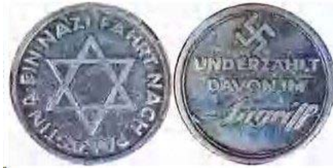
ZioNazi Medal? Zionist Star with Swastika on Opposite side.

http://jewssansfrontieres.blogspot.com/2007/05/zionazi-medal.html http://bp3.blogger.com/_7FKbMiiwOw0/RkbiFrTpJdI/AAAAAAAAA8/ZZpwzGvorKE/s1600-h/ZioNazi.jpg