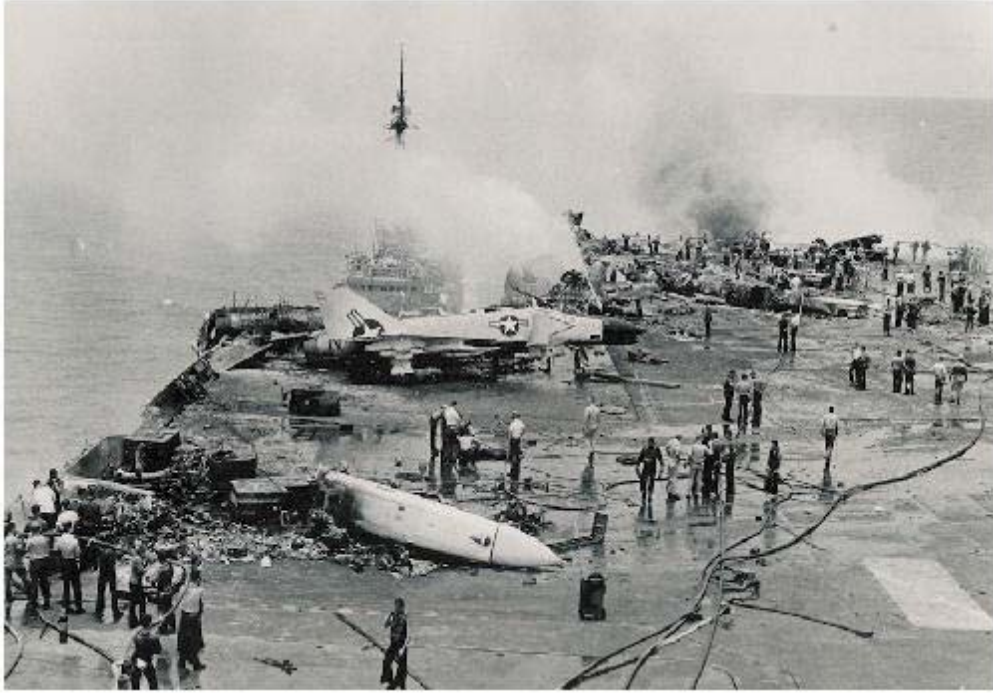
A Small Rocket Hit A Fuel Tank On Another Plane