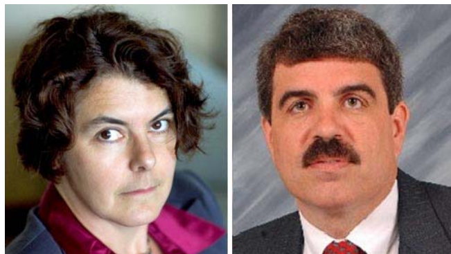
FBI