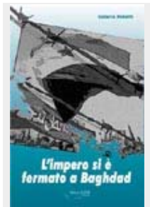
L'Impero si è fermato a Bahgdad, by Valeria Poletti

"It is pointless and illogical to hope for even a semblance of justice under a