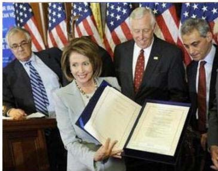
Four shining examples of great politicians