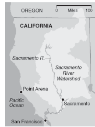
THE NEW YORK TIMES The New York Times The Chinook journey up and down the Sacramento River.

The Chinook salmon that swim upstream to spawn in the fall, the most robust run in the Sacramento River, have disappeared. The almost complete collapse of the richest and most dependable source of Chinook salmon south of Alaska left gloomy fisheries experts struggling for reliable explanations — and coming up dry.