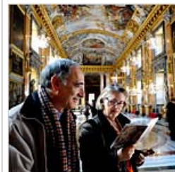
In Rome, Intimate Palaces for Every Taste