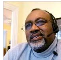
Bloggingheads Video: Obama's Grandmother