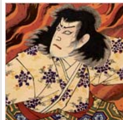
Pleasures of Life in Vibrant Woodcut Prints