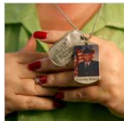
Military Kin Struggle With a Loss and Windfalls