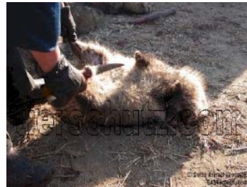
Animals rights activists have documented that China's fur industry skins animals alive for their fur