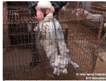
Dogs are picked up by workers using a metal tongs and their tails prior to being slammed to the ground and skinned.