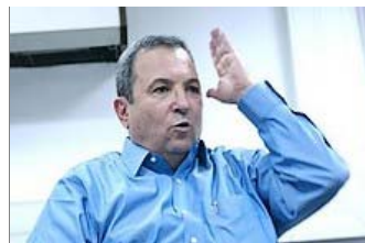
Defense Minister Ehud Barak.

The source added that the visits of the Israeli officials came as an intense debate