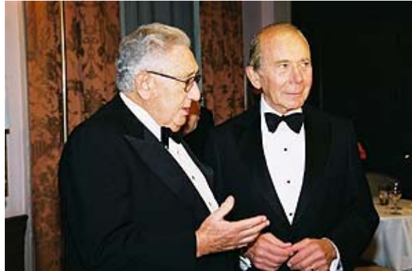
Kissinger and Greenberg

obvious manner, through dedicated and corrupt American Zionists like Jules Kroll and Maurice Greenberg. Shalom went to work for Kroll, according to the online 9/11 Encyclopedia entry for Maurice "Hank" Greenberg, the CEO of the American International Group (A.I.G.) insurance company. In 1993, Maurice Greenberg became a partner and co-owner of Jules Kroll's company when A.I.G. bought 23 percent of Kroll. Greenberg is very close to Henry Kissinger, who became chairman of A.I.G.'s International Advisory Board in 1987.