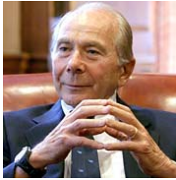
Maurice Greenberg The criminal head of A.I.G.