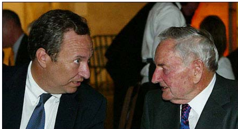
Larry Summers and David Rockefeller