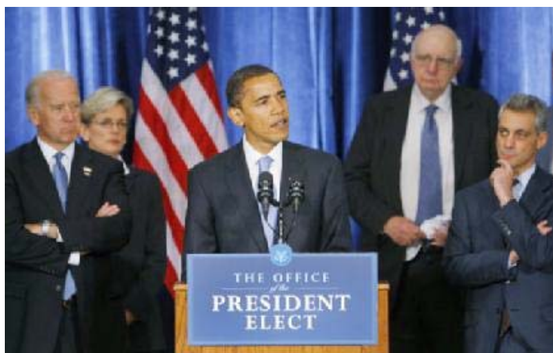
Barack Obama. November 7 Press Conference.

Unless there is a major upheaval in the system of political appointments to key positions, an alternative Obama economic agenda geared towards poverty alleviation and employment creation is highly unlikely.