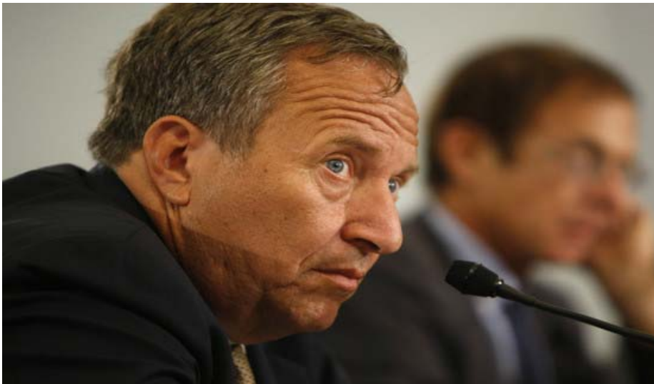
Larry Summers (left) and Timothy Geithner

Jon Corzine is currently governor of New Jersey, former CEO of Goldman Sachs.