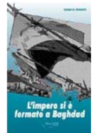
L'Impero si è fermato a Baghdad