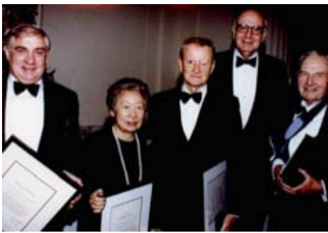
From left: Peter Sutherland, Sadako Ogata, Zbigniew Brzezinski, Paul Volcker, David Rockefeller. (25th Anniversary, New York, Dec. 1, 1998.)

It would have been damaging enough if the Trilateral domination of the Carter administration was merely a one-time anomaly; but it was not!