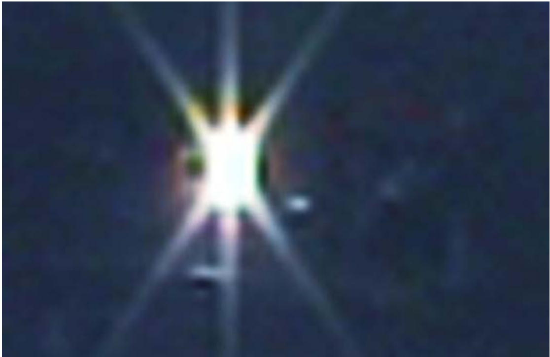
Second Type Of Helicopter Pays John A Visit