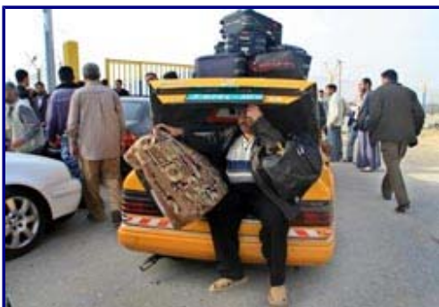
Rafah crossing is closed