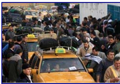
Rafah border where thousands are stranded