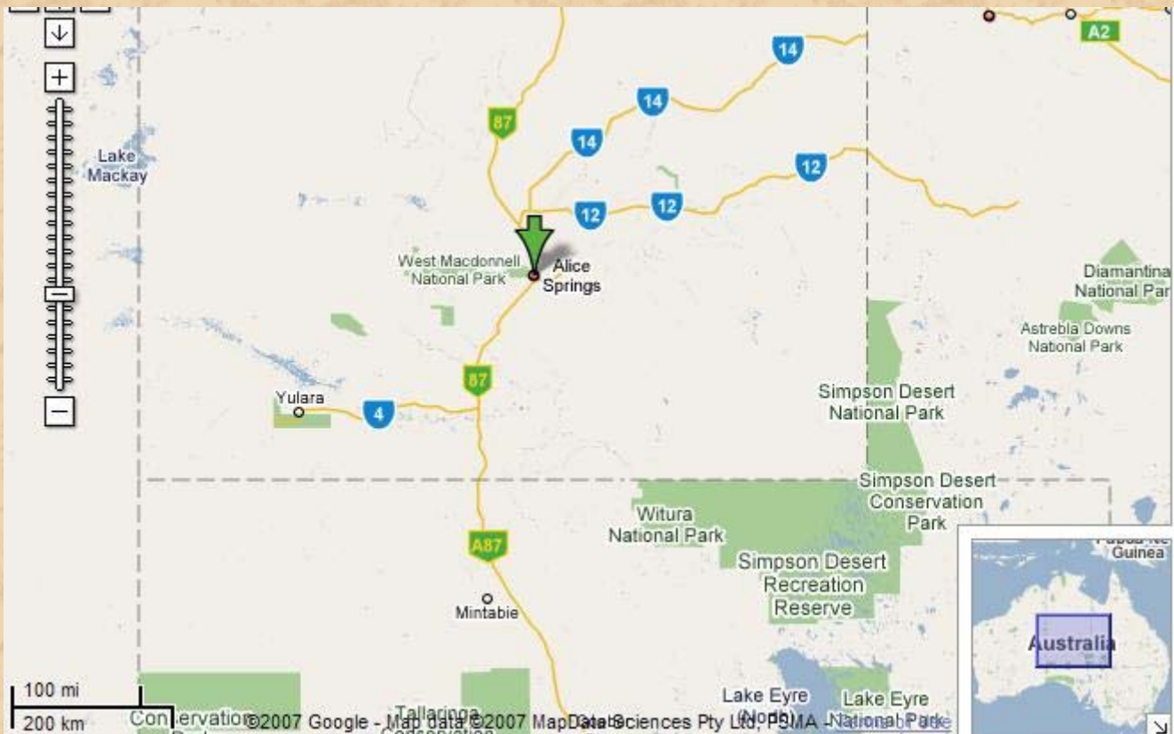
Fig. 1 - If Pine Gap appeared on the map above, the pointer to it would be a fraction of an inch on your screen from the pointer to the nearest town shown here, Alice Springs. Even

The distance legend in the lower left corner of this map shows that about 1" on your screen = 100 miles.