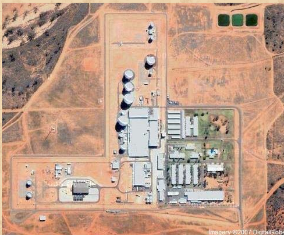
Fig. 2 - Here is a satellite photo [1] of what the Pine Gap base actually looks like. Note the double fenced perimeter around this base, which is located out in the middle of nowhere. (Perhaps this is to keep people IN?) This base is almost dead-centered on the Australian continent. According to eyewitness reports, this base stretches for many miles underground and these are just support buildings. Governments like to dig all the time, tunnelling like Prairie dogs to avoid spy satellites. They dig while you sleep. (Image reproduced here under fair use copyright law.)

If a map search on Google for Pine Gap is performed, only a street in a housing subdivision will be returned (not shown.)