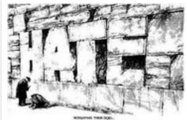
Radical Zionists bow before their master