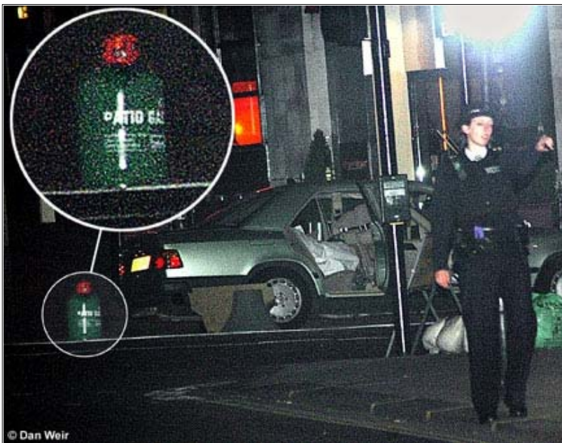
The silver car was left outside the Tiger Tiger nightclub on Haymarket. A gas canister can be seen in the bottom left-hand corner of this picture.

But as the facts emerge we would be foolish to overlook the fact that the British security services were intimately involved in numerous terror attacks in Britain over the past few decades, namely car bombings, that were blamed on the IRA or its offshoots. This is particularly relevant considering that officials have refused to rule out an Irish connection in this case.