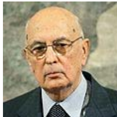
Italian President Giorgio Napolitano