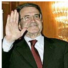
Italian PM Romano Prodi