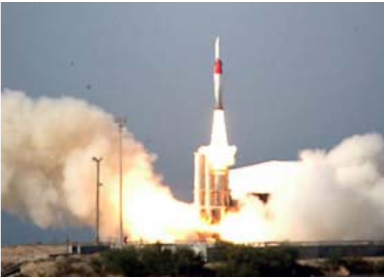
Israel is mulling a U.S. alternative to the Arrow anti-missile, shown during a test launch.