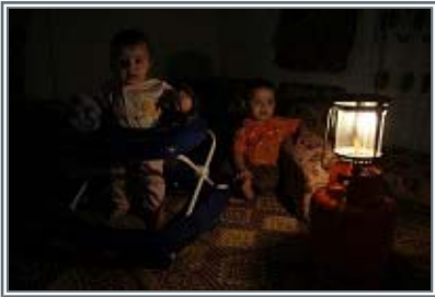
Palestinian children during recent black-out in Gaza

Bethlehem – Ma'an – The Israeli security cabinet declared the Gaza Strip an "enemy entity" on Wednesday and voted to gradually cut off fuel and electricity supplies to the poverty-stricken territory, according to Israeli press sources.