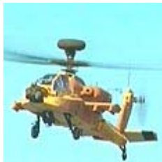
Part of a new 20-helicopter squadron. The Apache Longbow Apache helicopter