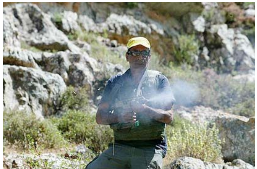
Guard shooting at journalists

Photos taken by AFP photographer Moussa al-Shaer clearly show one of the guards using an Uzi submachine gun to fire at the demonstrators. The other guards fired with live ammunition in the air, although they were not in danger at any stage.