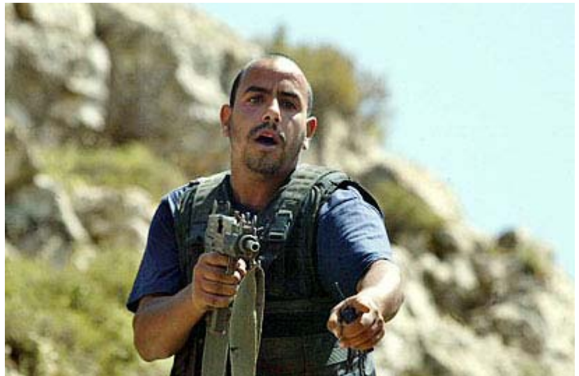
Another guard shooting at journalists