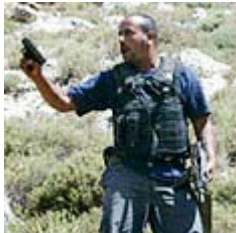
Pulling out guns