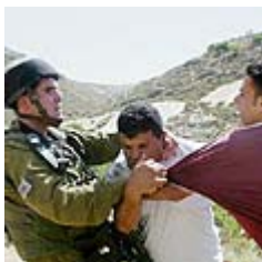
Palestinian arrested during demonstration