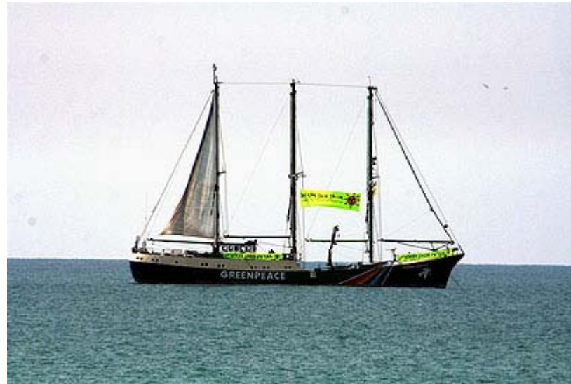
The Rainbow Warrior

The report presents various disaster scenarios in the Dimona nuclear facility, stating that the advanced age of the plant and its constant use have rendered it even more dangerous. A melt-down in Dimona could affect an area of up to 400 km, said the report.