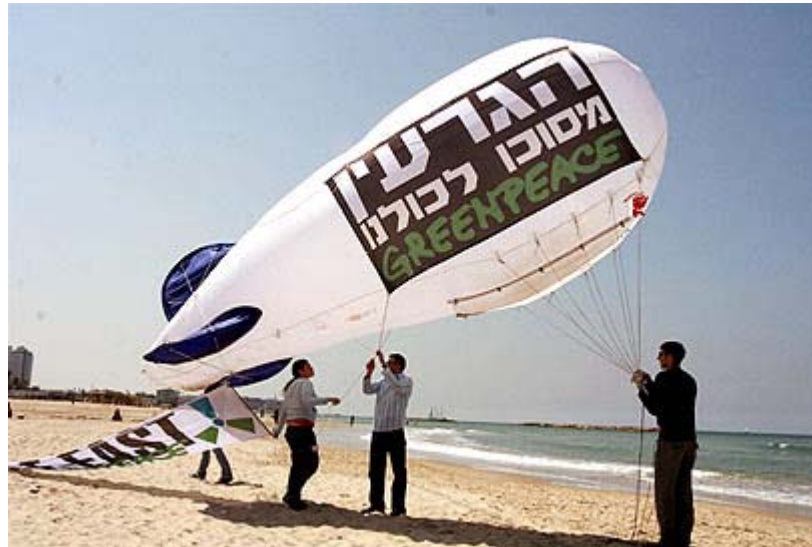
Greenpeace in Israel on Thursday

a banner calling for a 'Nuclear Free Middle East' and, in Hebrew, 'Nuclear is dangerous for us all.'