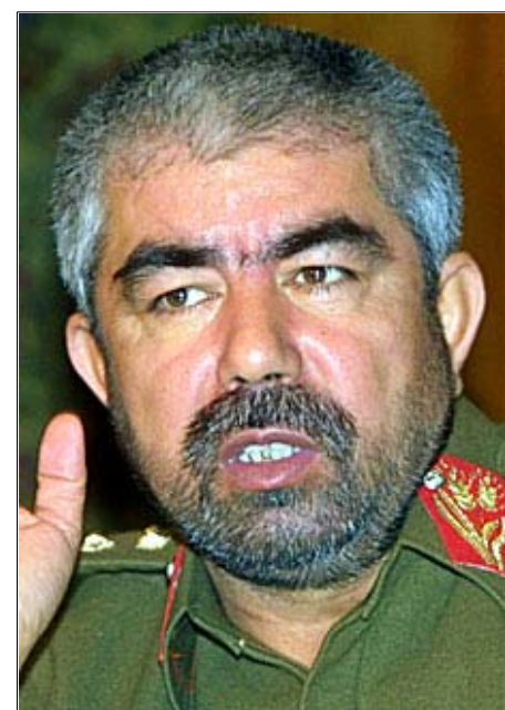
Head of the Afghan armed forces: General Abdul Rashid Dostum

So the attack on Afghanistan has enjoyed a much greater sense of public legitimacy. But the operation to remove Bin Laden was one thing. Six years of occupation are clearly another.