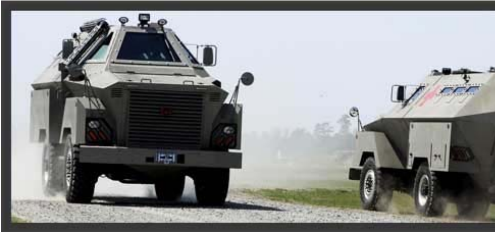
BUSA "Grizzly" APC