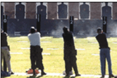
Blackwater target system

This sure doesn't look like the under-armored junk the military use. Of course, our military doesn't have multi-billion dollar corporations backing it up, even though our government does.