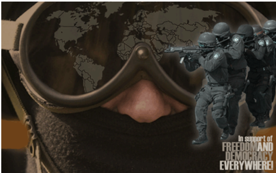
The NEW face of Democracy

Blackwater USA comprises nine separate business units to offer the most comprehensive professional security, peacekeeping, and stability operations company in the world.