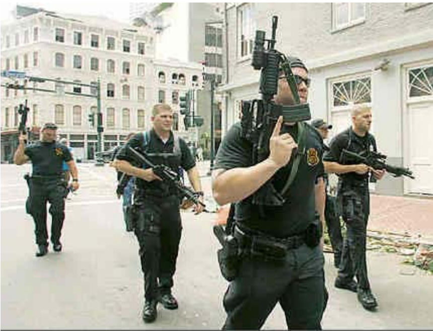
BUSA "Katrina Mission"

"This is a trend. You're going to see a lot more guys like us in these situations."-Blackwater merc commenting on Katrina