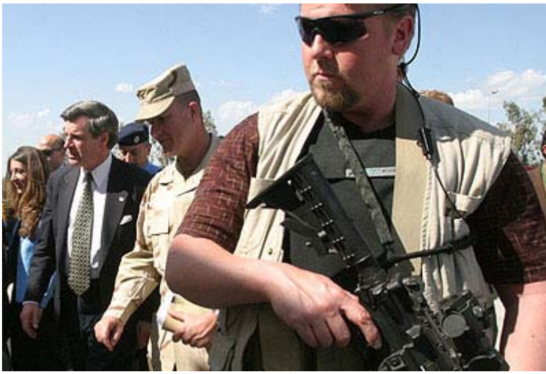
Yeoman: BUSA mercs

At a remote tactical training camp, in a swamp 25 miles from the world's largest naval base, six U.S. sailors are gearing up for their part in President Bush's war on terrorism. Dressed in camouflage on a January afternoon, they wear protective masks and carry nine-millimeter Berettas that fire nonlethal bullets filled with colored soap. Their mission: recapture a ship -- actually a three-story-high model constructed of gray steel cargo containers -- from armed hijackers.