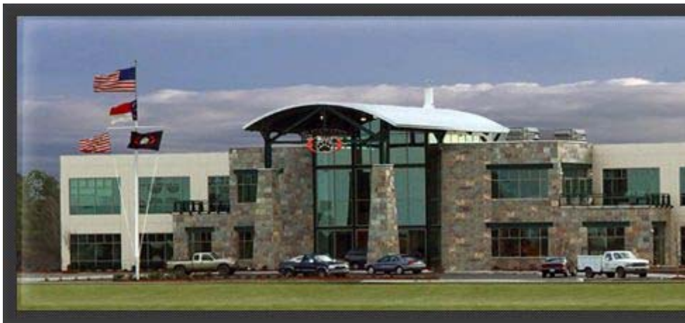
BUSA Headquartes Moyock

Blackwater makes a killing, literally and monetarily!