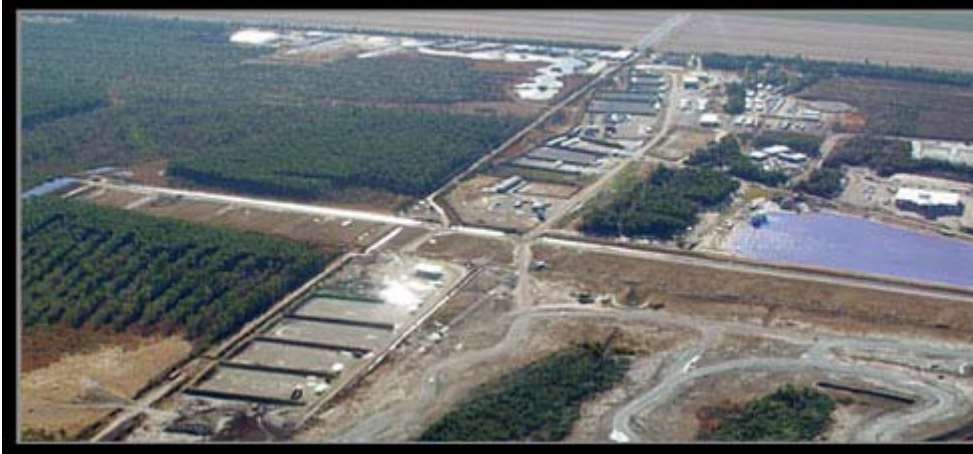
BUSA COMPOUND MOYOCK, N.C.

So if the aforementioned isn't enough, how about being able to build anything [jails and compounds], anywhere, any time. Meet Blackwater construction: