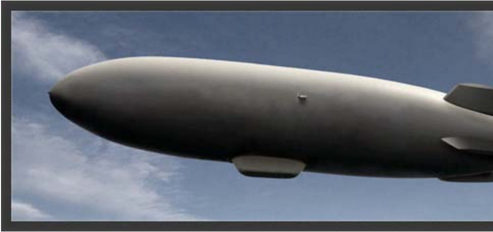
Blackwater Orwellian Blimp

So now let's see if Orwell was a prophet. Oceana here we are.