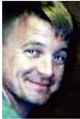
"Captain" Erik Prince