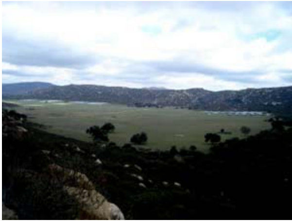
Round Potero Valley future site of Blackwater West

vehicle training, an 18,000 sqft armory (almost 1/2 acre of guns and ammo,) dormitories, mess hall, etc. The intention is to service 15,000 trainees each year (300 per week) with 60 staff in residence on site.