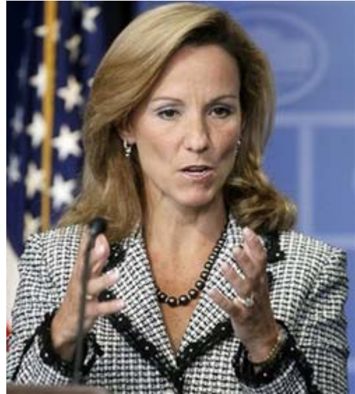
White House Homeland Security Advisor Fran Townsend Refused To Talk About The Implausible Notion That Bin Laden Is Still Alive And Left The Press Conference Immediately After.

In addition, a leaked French secret service memo last year concluded that Bin Laden had died of typhoid poisoning in August 2006. The memo cited Saudi Arabian secret service sources who were convinced that Bin Laden had died in Pakistan.