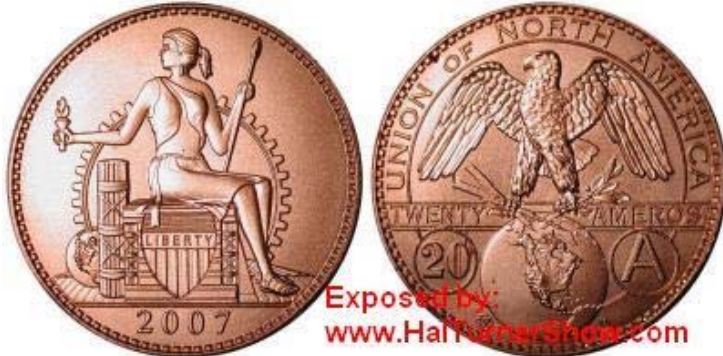
Exposed by: www.HalTurnerShow.com

"The Hal Turner Show" has received images of the new unit of currency they are planning. It is called "the Amero" which will replace the "Dollar" and the "peso" in all three countries once they are merged out of existence!