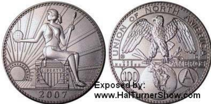
Exposed by: www.HalTurnerShow.com

They are even coining "Ameros" in Collectable precious metals like Silver as the "Proof" coin shown below!!