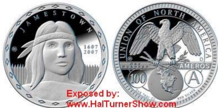
Exposed by: www.HalTurnerShow.com

They are even coining "Ameros" in Collectable precious metals like Silver as the "Proof" coin shown below!!