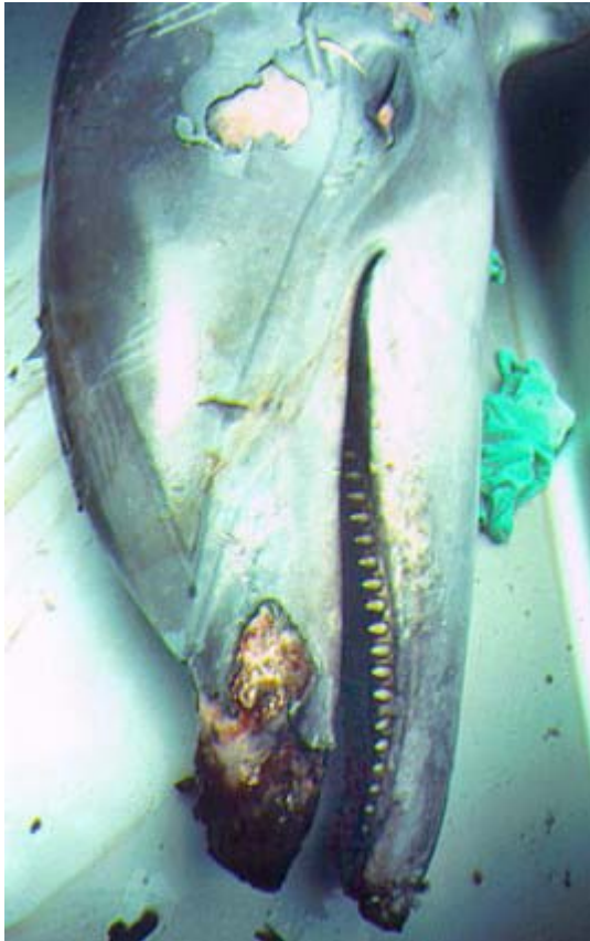
The SS William Ralston filled with 301,000 mustard gas bombs and 1,500 1-ton canisters of Lewsite -- sinks in the Pacific off San Francisco in 1958

Hundreds of dolphins washed ashore in Virginia and New Jersey shorelines in 1987 with burns similar to mustard gas exposure. One marine-mammal specialist suspects Army-dumped chemical weapons killed them.