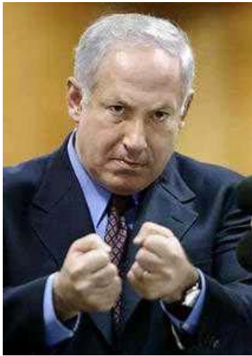
Benjamin Netanyahu, "War on Terror" Architect

Evans is endorsed by the most radical right-wing Zionists, including Benjamin Netanyahu, one of the terrorist architects of the "War on Terror."