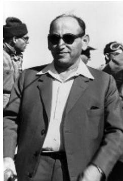
Isser Harel, Israeli intelligence chief in 1961