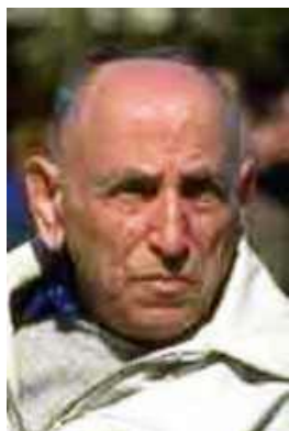
Isser Harel, Senior Israeli spymaster and terrorist, knew of Israeli plans to bomb the WTC -- in 1980.

On Sept. 23, 1979, the founder of Israeli intelligence over dinner told me that America was developing a tolerance for terror. The gentleman's name was Isser Harel, the founder of Mossad Israeli intelligence -- he ran it from 1947 to 1963.