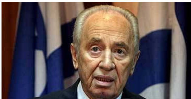
Shimon Peres, President of Israel and Senior Terrorist

The key people involved in these earlier Israeli terror attacks against Western targets, and their connections to 9-11, are the focus of this chapter.