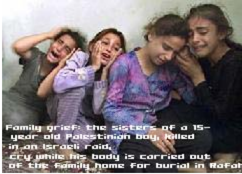
Family grief: the sisters of a 15- year old Palestinian boy, killed in an Israeli raid, cry while his body is carried out of the family home for burial in Rafah.