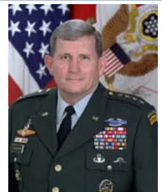
Peter Schoomaker — US Army Chief of Staff; former SOCOM (Special Operations Command) chief; ran Able Danger