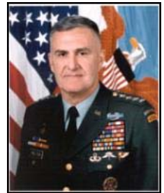
Henry Shelton — chairman of Joint Chiefs of Staff on 9-11; supported formation of Able Danger