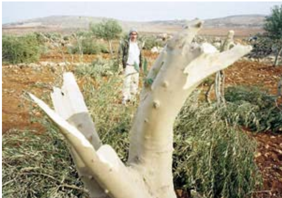
An olive tree belonging to Palestinians cut down by settlers in the West Bank.

Print Edition | Diplomacy | Defense | Opinion | National | Arts & Leisure | Anglo File | Sports | Travel Magazine | Week's End | Q&A | Business | Underground | Jewish World | Real Estate | Advertising | Singles