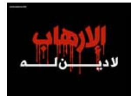
Terrorism Has No Religion

Visit www.noterror.info for more information.