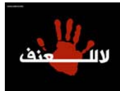
No to Violence