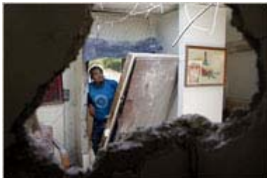
Shelling in Northern Israel