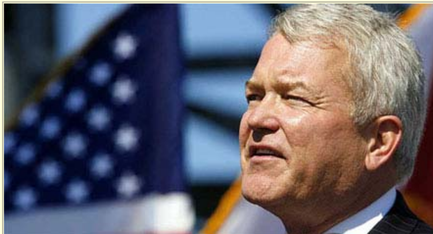
Defrocked Congressman Mark Foley, poster boy for rampant homosexuality of Republicans and Democrats alike in Washington, DC.

Extending outside the White House, we find even more evidence of the sicko regime: GOP Congressmen Mark Foley, Danny Hastert, Jim Kolbe, and a slew of others, including Governors, Senators, and Judges. Homoerotic thugs all, and not a few pedophile predators among them. The evil goes back all the way to the Lyndon B. Johnson and the Reagan Administrations. Many of President Ronald "Hollywood" Reagan's White House pals were also sodomites.