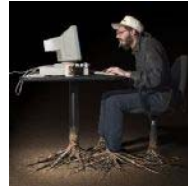
Webmaster My Profile

Subject: Issue 181: Vaccination Injuries Conspiracy Uncovered Username: Webmaster Date: 10/9/2006 3:18:25 PM ( 14 days ago ) Printer friendly: Email to a friend: Hits: message viewed 1003 times Size: 18598 char. URL: http://curezone.com/forums/fm.asp?i=751081 Replies: 1