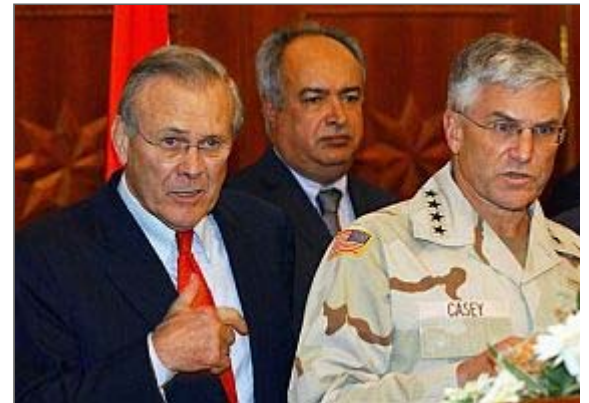
US Secretary of Defense Donald Rumsfeld

Although Der Spiegel could not say that these plans were concrete, they did note that according to a January 2005 New Yorker report American forces had entered Iran in 2005 in order to mark possible targets for an aerial assault.